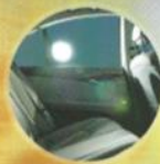
REDUCE GLARE, HEAT & HARMFUL UV RAYS