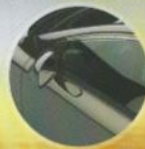
WINDOW FILM WON'T FADE OR TURN PURPLE