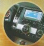
WON'T INTERFERE WITH GPS OR RADIO SIGNALS