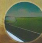
AVAILABLE IN BLACK TO MATCH PRIVACY GLASS